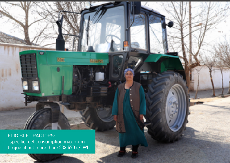
ELIGIBLE TRACTORS: -specific fuel consumption maximum torque of not more than: 233,570 g/kWh